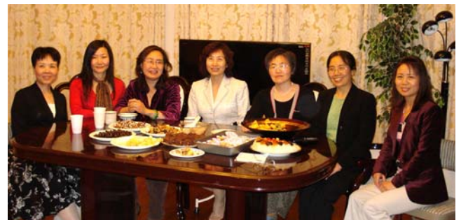
HMU 7 8 级的“资深美女”们