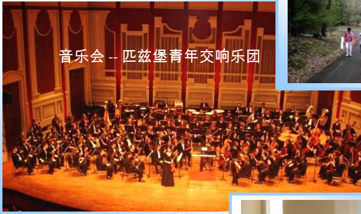
音乐会 -- 匹兹堡青年交响乐团