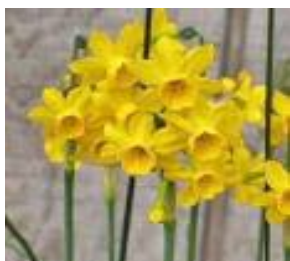
Daffodil, blooming in March to April

(Part 2 will be released in future Newsletter)