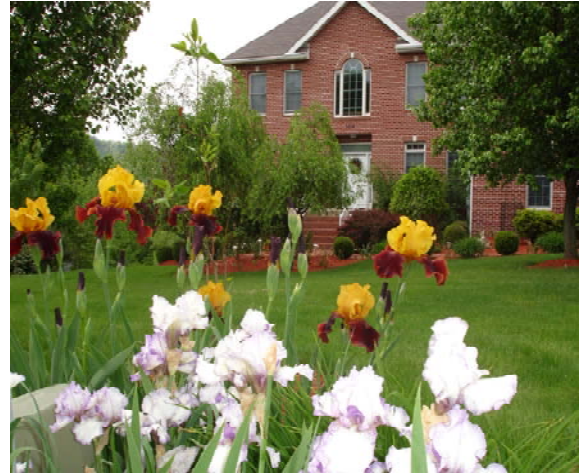
IRIS, blooming in May