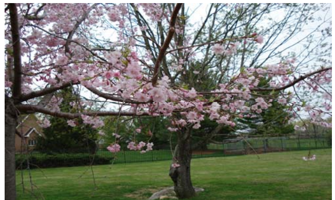
Weeping cherry, blooming in April